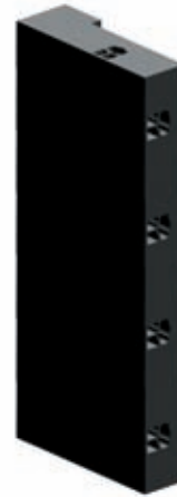
Inner Corner Element 300 x 100 x H 600mm