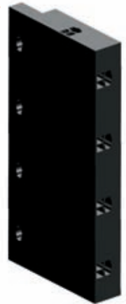
Outer Corner Element 330 x H 600mm