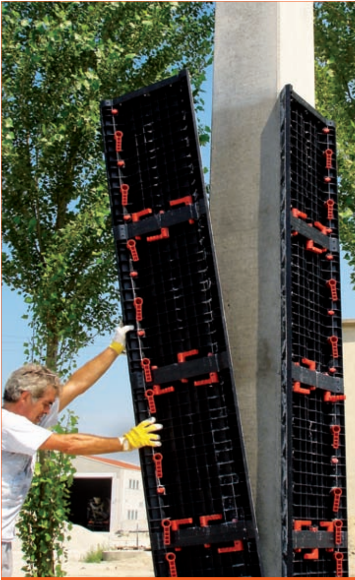
Geotub Circular formers